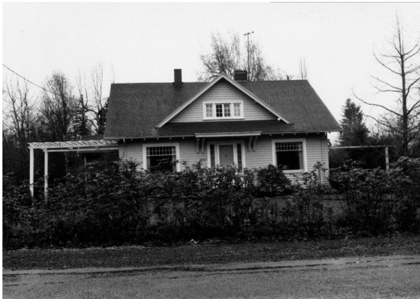
Figure 3: Looking north at the south façade. Date unknown. Photo ID: HRAB122