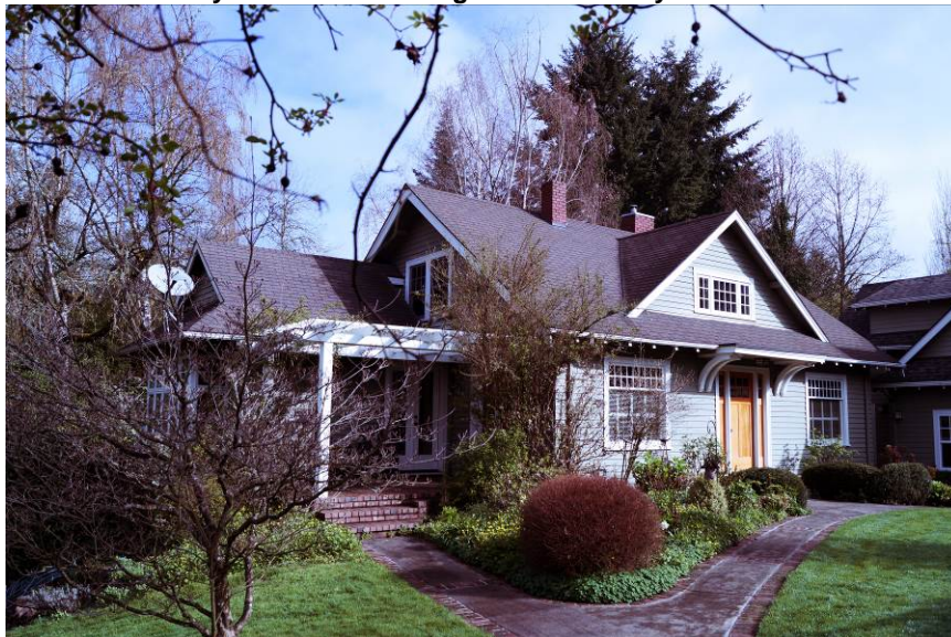
Figure 4. Looking northeast at the south and west façade. August 2014.