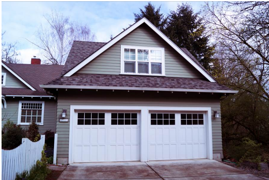
Figure 6. Looking north at the south façade of garage. August 2014.