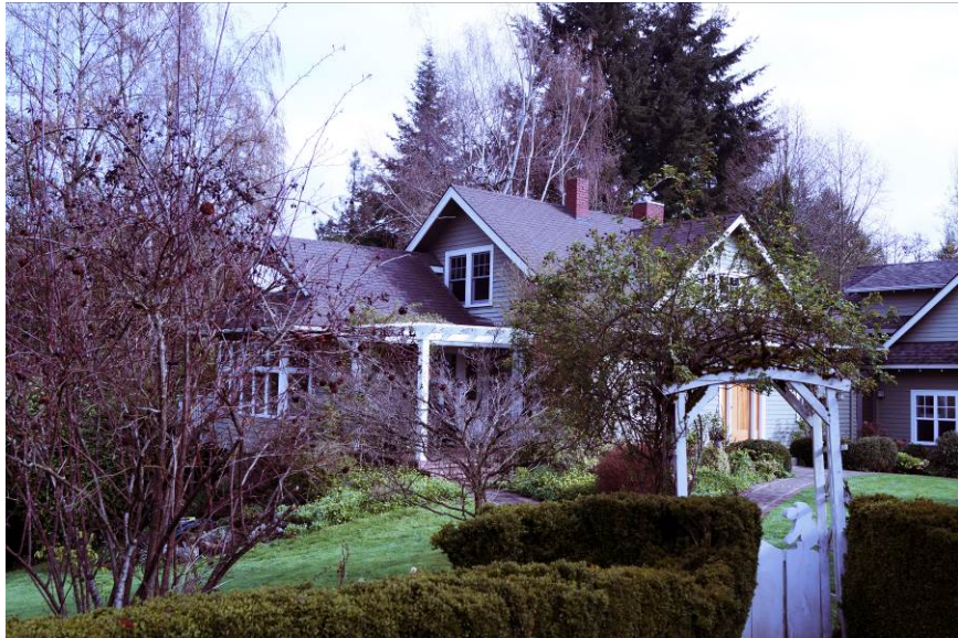
Figure 5: Looking northeast at the south and west façade. August 2014